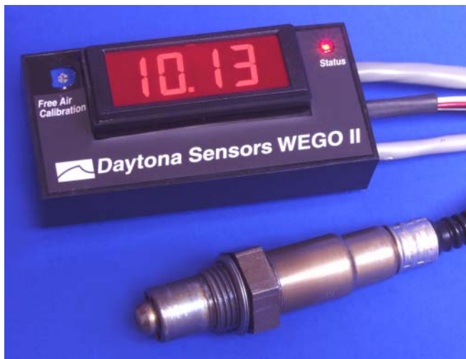
Figure 2 - WEGO II Unit

After installation, the WEGO II system requires free air calibration. This should be done with the sensor dangling in free air. The environment must be free of hydrocarbon vapors. We suggest that you perform the free air calibration outdoors. Turn the free air adjustment trimpot on the WEGO II full