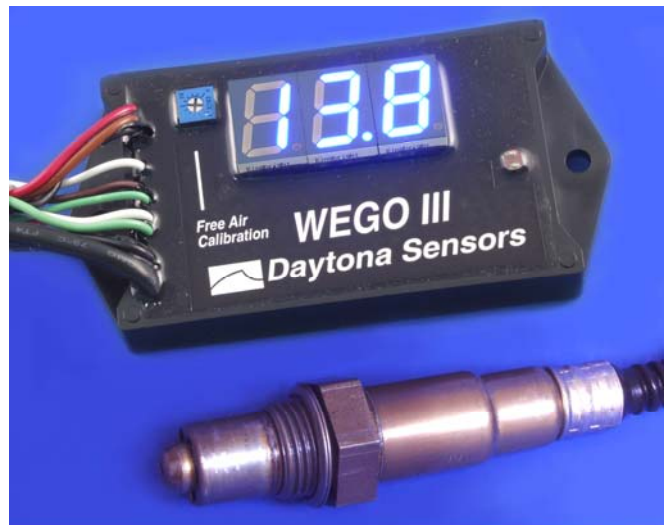
Figure 2 - WEGO III Unit

The free air calibration procedure should be performed at reasonable intervals (every 250-500 hours) or whenever the sensor is replaced. If you cannot get the display to indicate "FA" when the trimpot is turned full clockwise (sensor in free air), you either have a damaged sensor or very high hydrocarbon levels in your environment.