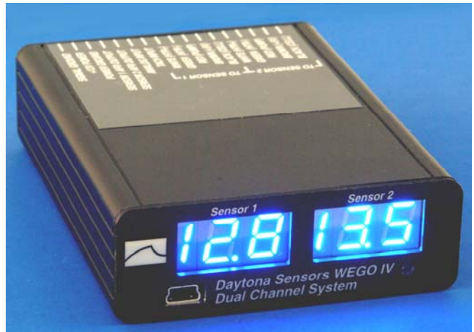
Figure 2 - WEGO IV Dual Channel Unit

After installation, the WEGO IV system requires free air calibration. This should be done with the sensors dangling in free air. The environment must be free of hydrocarbon vapors. We suggest that you perform the free air calibration outdoors. Turn the free air calibration trimpots (located on the bottom of the WEGO IV unit) full counterclockwise. Turn on power and wait for 60 seconds so the system can fully stabilize. Then slowly turn each free air calibration trimpot clockwise until the corresponding display indicates "FA". Try to set each trimpot at the point where the display just starts to indicate "FA". The free air calibration procedure should be performed at reasonable intervals (every 250-500 hours) or