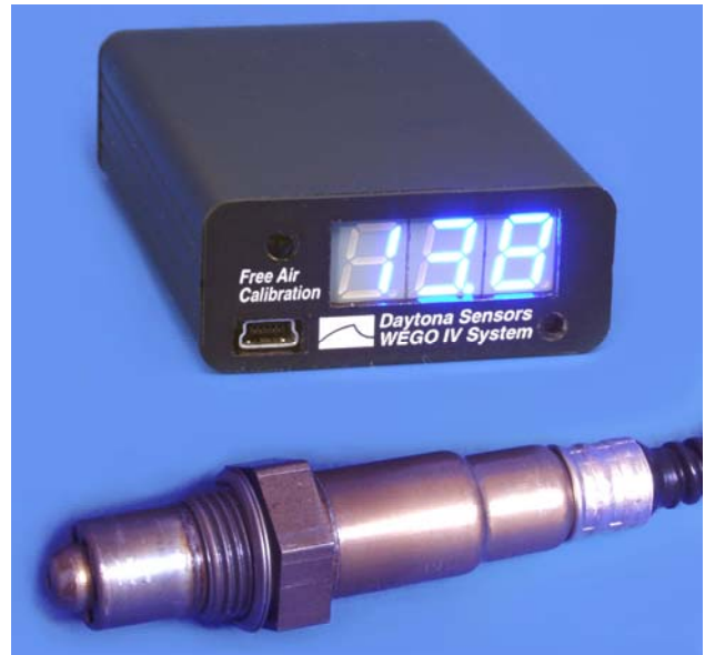
Figure 2 - WEGO IV Unit

After installation, the WEGO IV system requires free air calibration. This should be done with the sensor dangling in free air. The environment must be free of hydrocarbon vapors. We suggest that you perform the free air calibration outdoors. Turn the free air calibration trimpot on the WEGO IV full counterclockwise. Turn on power and wait for 60 seconds so the system can fully stabilize. Then slowly turn the free air calibration trimpot clockwise until the display indicates "FA". Try to set the trimpot at the point where the display just starts to indicate "FA".